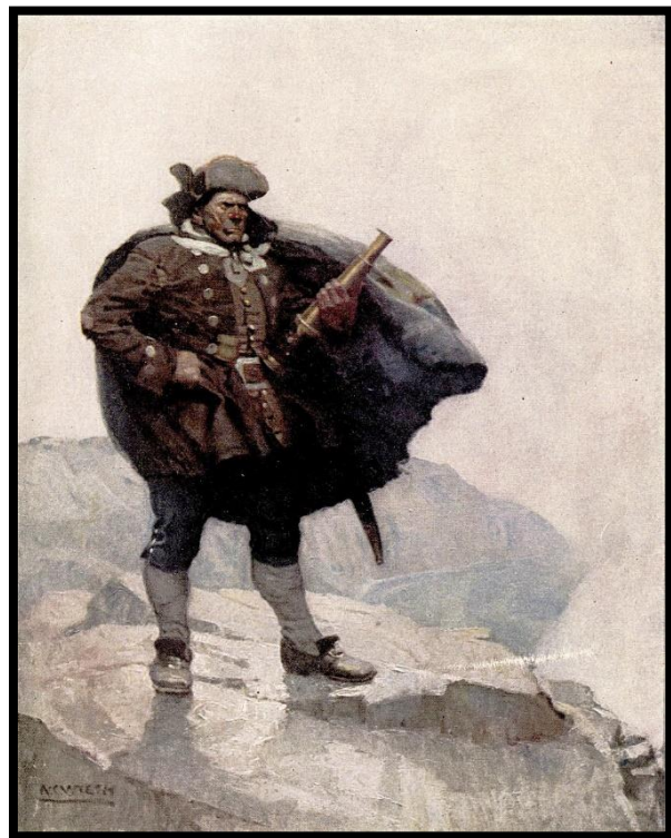
Figure 2. Billy Bones. From R.L. Stevenson, Treasure Island . Scribner: New York, 1911.

However, Billy’s sickened, remorseful, and knowing expression 40 juxtaposed against the unnervingly joyful chants of “Flint! Flint! Flint!” 41 reveals the truth of this spectacle. Billy recognizes that Flint’s invocation of collective glory is a lie, the blank page in his hands working as the instrument of this deceit. 42 Rather, it is Flint who will stop at nothing to ensure the prize is obtained, his monomania symbolized by the brutalized corpse at his feet. The shared glory is the wicked fiction Flint creates, the blood of the Walrus’s sailors the ink with which he will inscribe that empty page, that empty promise. By casting his tale amidst this scene of overwhelming violence, Flint enacts violence against the tradition of yarning itself. Specifically, Rediker asserts that a portion of the yarn’s power lay in its ability to incite “resistance” to traditional notions of eighteenth-century propriety amongst pirates. 43 However,