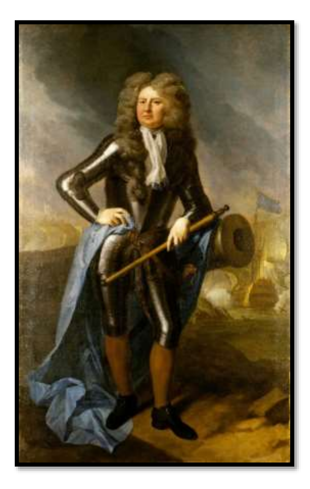
FIGURE 1 ADMIRAL CLOUDESELY SHOVALL.

This narrative outline of two very similar naval disasters, separated by over two centuries, shows how history can be repeated and for very similar reasons. It demonstrates the frailty of human decision-making, using a brain that has scarcely evolved over the past 10,000 years, and it attempts to explain some of the mental aberrations behind human error. Experience is no