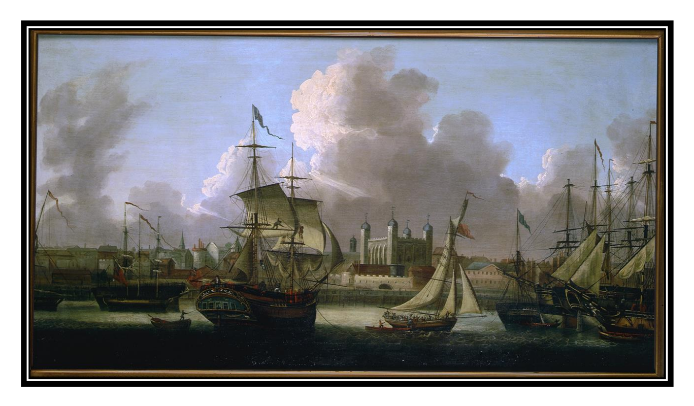
Figure 6: Shipping in the Pool of London , by Robert Dowd, Eighteenth century, Oil on Canvas, 76.2 cm X 137.2 cm, BHC 1879, National Maritime Museum, Greenwich London, UK.

The ship was unloaded by June 3, 1761 and most of the cargo was sold during the next few months. The turpentine was held over the winter for a better price, but was sold very cheaply the following spring, and the British bounties granted to the various naval stores were delayed until 1769 due to a problem with Customs. Although North American furs had been a feature of mixed cargoes to England since the seventeenth century, the six hogsheads of fur shipped on the Benjamin and Samuel by Sarah Nicholson arrived into a booming London market. The British had taken control of the entire North American fur trade with the conquest of Montreal in 1760, making London the principal import-export center of pelts for all of Europe and even Russia. Vaughan again put the Benjamin and Samuel up for sale, but with no immediate offers he was unsure what to do next, and again criticized the ship: "... as long as she is in your employ, she will pick your pocket, as she carries nothing in proportion to her tonnage... there is no freight for Lisbon, so shall be under necessity to lay her up, or send her for a load of coals to Newcastle in her way to Boston." <sup>34</sup>