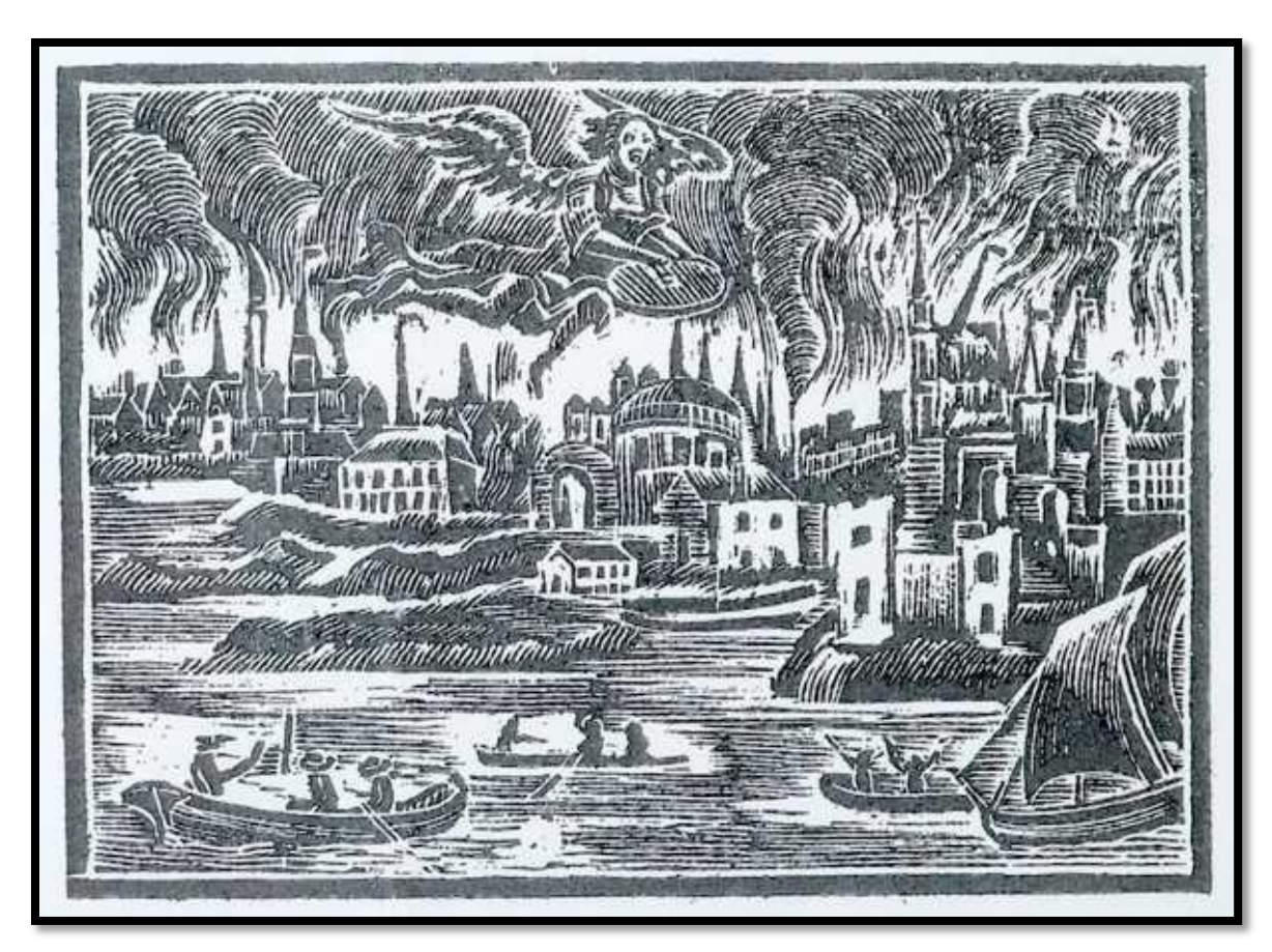
Figure 1: The Angel of Death (Boston Fire March 20, 1760) , by Zechariah Fowle, Woodcut, 1760, Samuel Draper printer, Boston. (J. L. Bell, boston1775.blogspot.com, January 14, 2019).