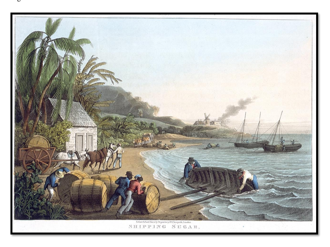
Figure 3: Shipping Sugar, Plate 6 of Ten Views in the Island of Antigua , by William Clark, Hand Colored Aquatint and Etching, 1823, Thomas Clay publisher, London, (Wikipedia). Note the large size of the hogsheads and the use of rolling to move them around.

and eight Seamen were hired between May 10 and 30. One sailor took his advanced wages and ran after only two days, and several men had once served on the Massachusetts warship King George . The number of merchant ships and privateers operating out of Boston during the War drained the available pool of seamen, often resulting in manning problems for the Province warship. The Seamen's wages varied between £2.5 and £3.10 per month, while the un-rated Boy and the Cook were the lowest paid crew members at £2. The two Mates and the Boatswain each received £4, and Patten himself was paid £6 per month. The fact that the last crew members were hired in late May indicates that an early spring departure was never actually contemplated or possible. Traditionally, ships travelling from the Northern Colonies to England would leave in March or April, be back in time for a second trip out in September or October, and lay over in England for the winter.<sup>15</sup>