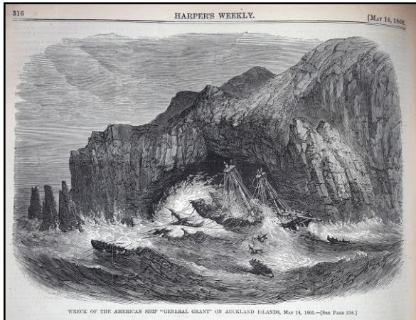
Figure 3. From Harper's Weekly, May 16, 1868. One month after Illustrated London News image was published. Exact same image. Harper's claims it as their own.

By 2008, at least thirty-six known separate salvage operations had tried to search for the ship's gold, nineteen of which had actually arrived on site. Three were within the first eight years of the loss of the vessel and involved actual General Grant survivors. Once at the Auckland Islands, however, success often eluded searchers due to heavy weather, rough seas, shaky financing and/or quarrelsome