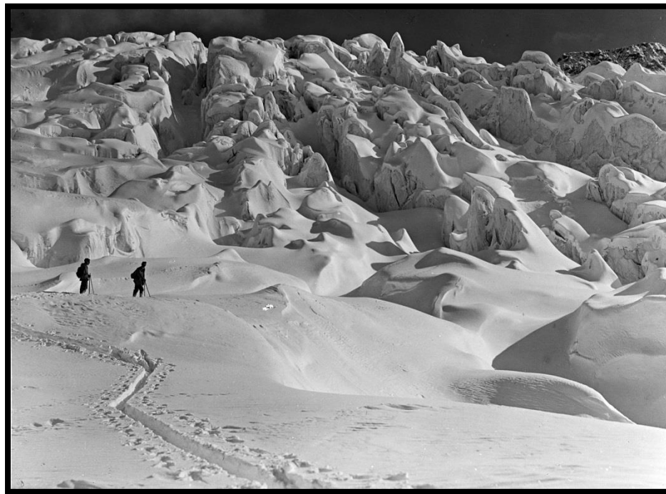
Figure 4 South Georgia mountains.

Again, the dangerous overland journey by Shackleton, Tom Crean, and Frank Worsley from King Haakon Bay to Stromness on South Georgia was hardly conducive to reading, but there was one important exception: