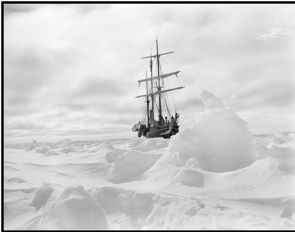
Figure 3 'Endurance' frozen in the ice.