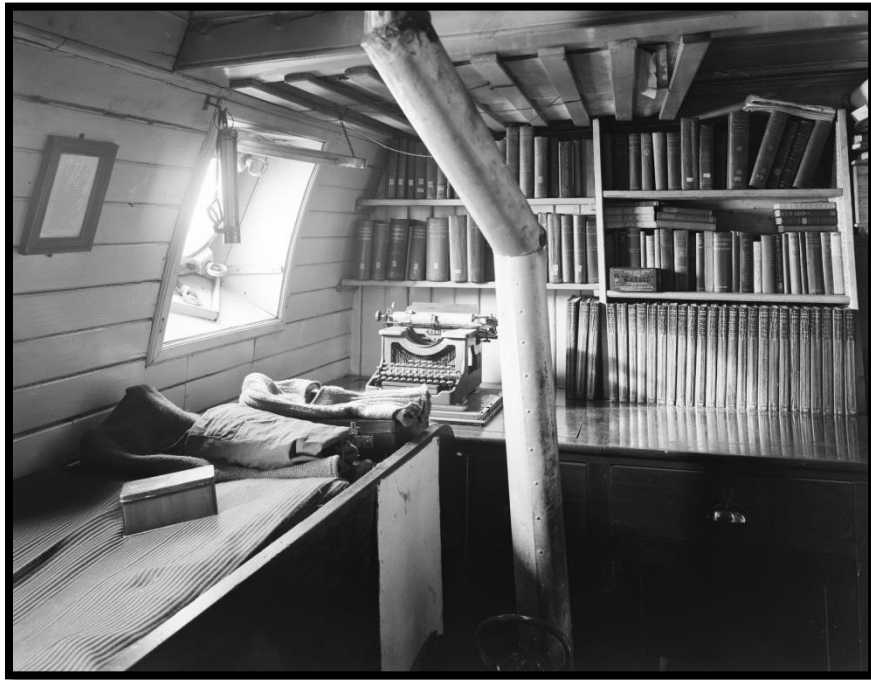
Figure 2 Ernest Shackleton's cabin on the 'Endurance'.