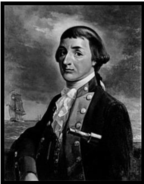
Figure 1. Capt. Gustavus Conyngham. Painting by V. Zveg, 1976, based on a miniature by Louis Marie Sicardi. Courtesy of the U.S. Navy Art Collection, Washington, D.C. U.S. Naval History and Heritage Command Photograph.

After the onset of the American Revolutionary War, Patriot leaders realized that an American maritime harassment of British commercial shipping close-to-home and British seaside communities was likely to produce shock — if not awe. This "asymmetric" battle strategy, sometimes-called irregular warfare, uses unconventional tactics to exploit the vulnerabilities of the stronger opponent.