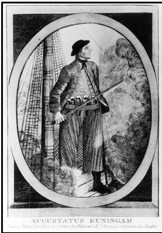
Figure 4. Eighteenth Century French engraving, reproduced in Letters and Papers relating to the Cruises of Gustavus Conyngham , edited by Robert Wilden Neeser, 1915.

26 July, Northampton , cargo of timber, hemp and iron. Captured on the North Sea and taken as a prize vessel and sent to Spain.